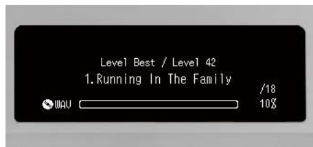
Showing process of CD import

Optional software Song Kong adds more detailed metadata to your music collection.